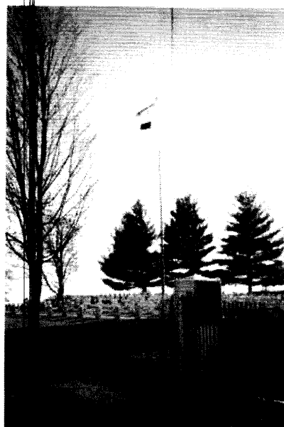
Cemetery Photo Added by: Ed Elam