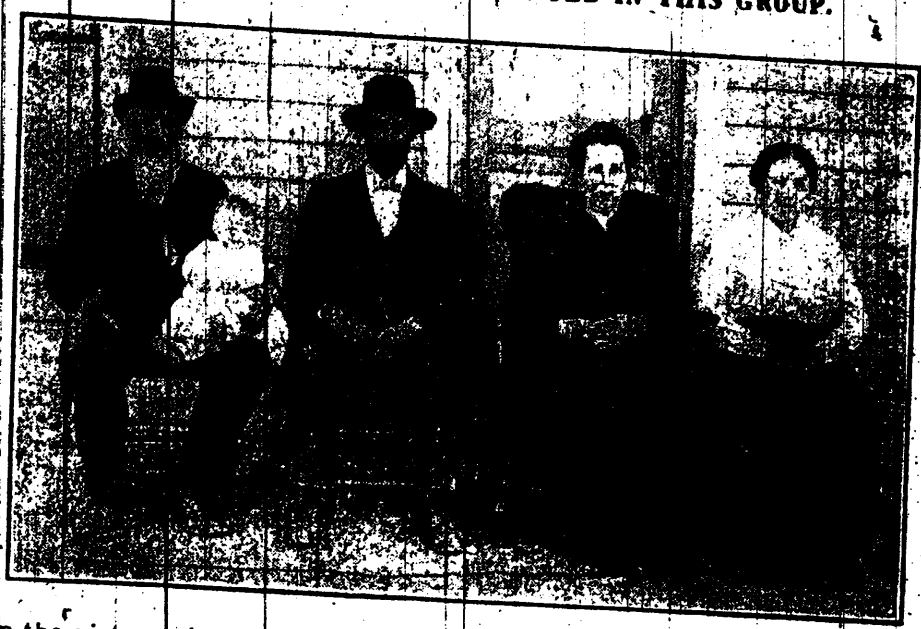
FIVE GENERATIONS REPRESENTED IN THIS GROUP.