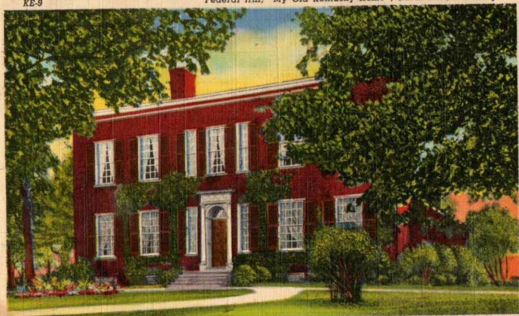
Federal Hill, "My Old Kentucky Home", Bardstown, Kentucky