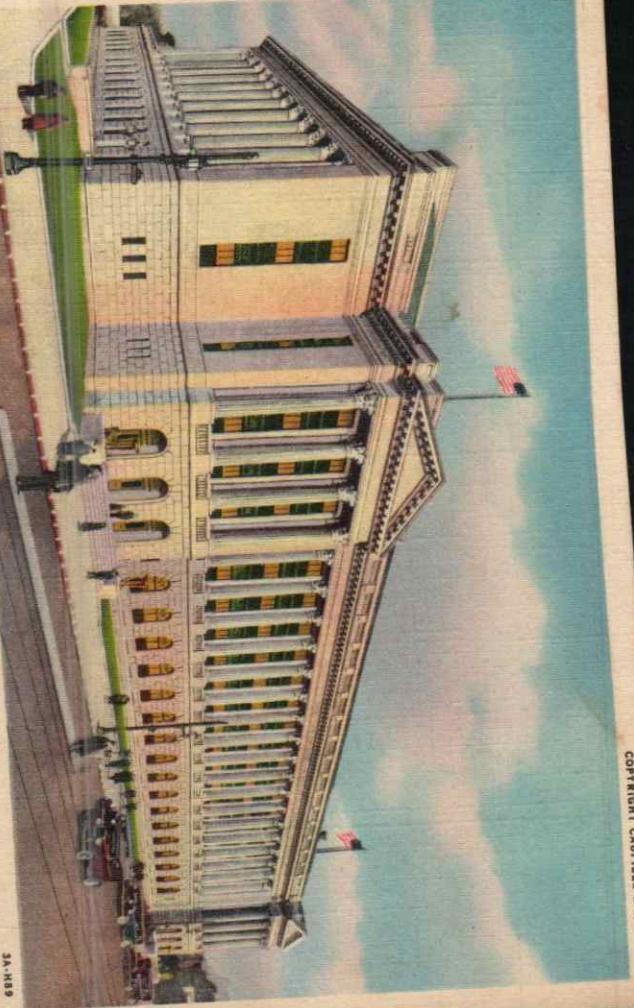
UNITED STATES POST OFFICE, COURT HOUSE AND CUSTOM HOUSE, LOUISVILLE, KY.