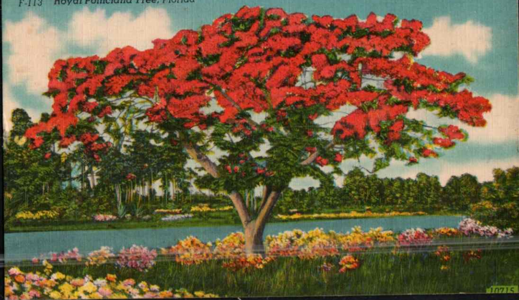
F-113 Royal Poinciana Tree, Florida