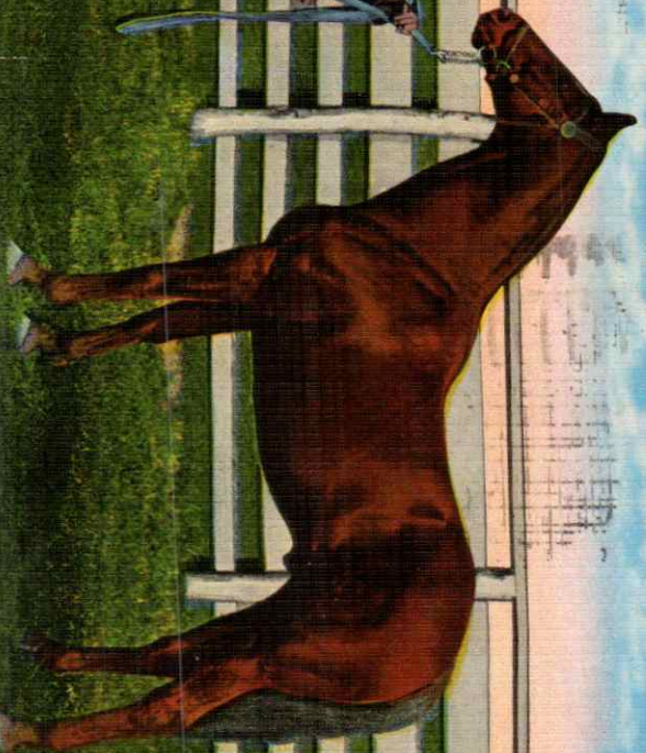
"MAN-O-WAR," THE WONDER HORSE—V482